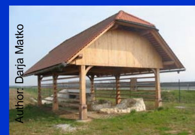
Author: Darja Matko

It would be nice to have the hay-racks re-built and repaired, wherever possible, and enable them to continue their function in the peasant economy and their role in shaping the cultural landscape.