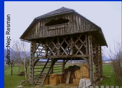
Author: Nejc Resman

A topolar is the most complicated hay-rack. Two front pieces (brani) had to be built plus the nucleus and the length. The length of the topolar was defined by the sum of the basic measure elements.