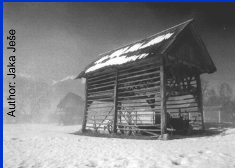
Author: Jaka Ješe

The hay-rack in Slovenia sprang from the needs of agriculture and animal husbandry in the territory between the Alps and Pannonian lowlands. Over the centuries, a whole variety of types of hay-racks developed in Slovenia. From the most modest drying devices-single hay-racks to the bigger and complicated constructions.